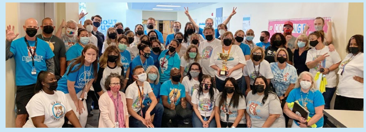
Students, Staff Engage in Spirit Week: It was a week filled with pride and fun as PSUSD students and staff members embraced this fall's "Spirit Week" as part of Attendance Awareness Month in September. Activities included Door Decorating, Sunglasses Day, Mix It Up at Lunch, Mismatch Day and School Pride Day. Trophies were awarded to Raymond Cree Middle School, right, for having the highest participation rate at the middle school level and Bella Vista Elementary, left, for having the highest participation of any district school.